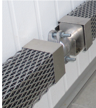
Expanded Aluminum Cover

BioTherm SunFin ™ is our highest heat output finned pipe commonly used for perimeter, top, and gutter heating. Manufactured completely from aluminum, a SunFin pipe does not rust. It is designed with maximum surface area to transport hot water and dissipate large amounts of heat through its fins.